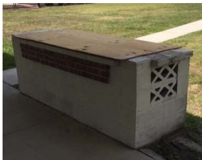
Grill Box Before