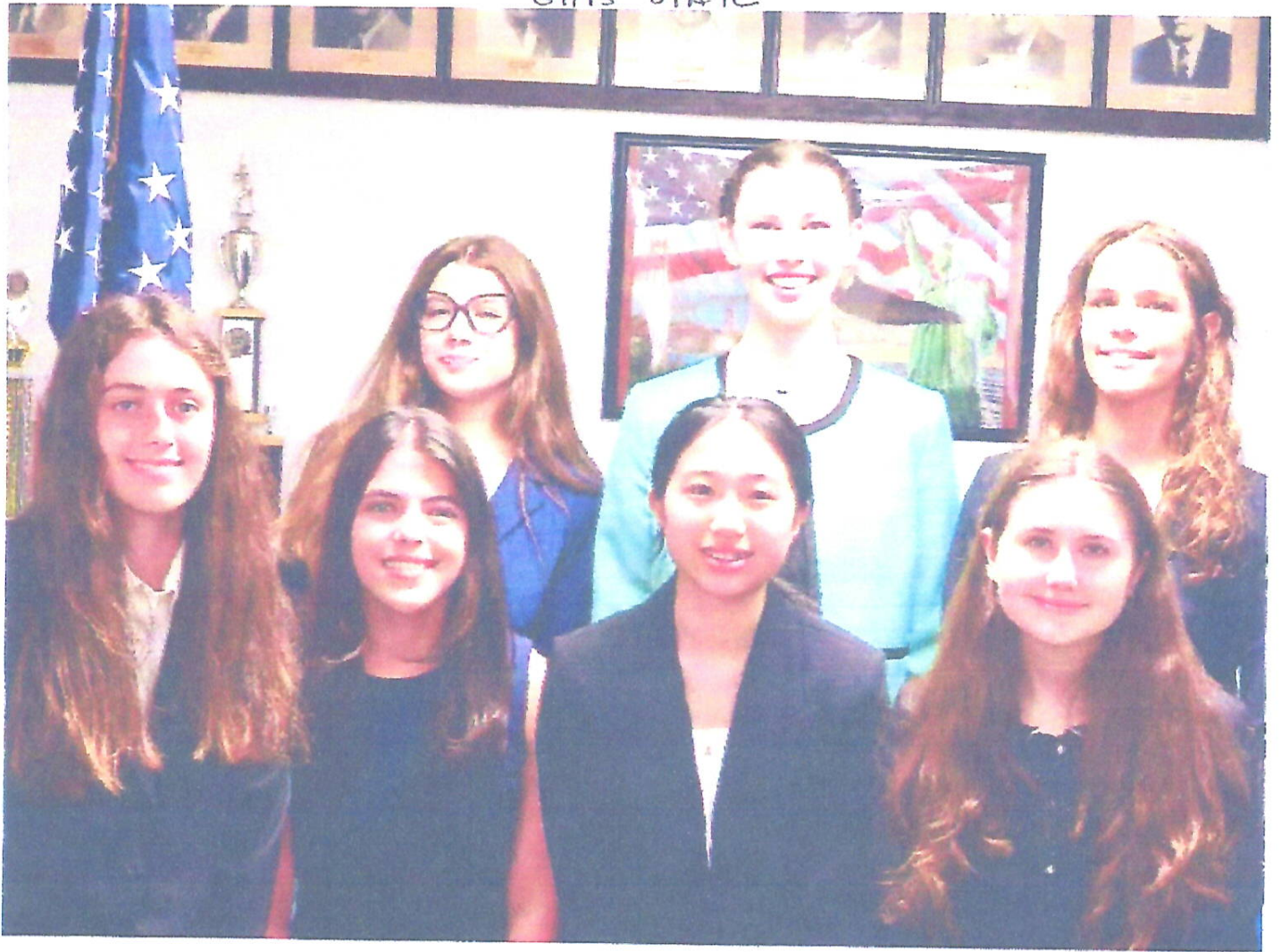
American Legion Auxiliary, Winter Park Memorial Unit 112 2026 Interview Candidates