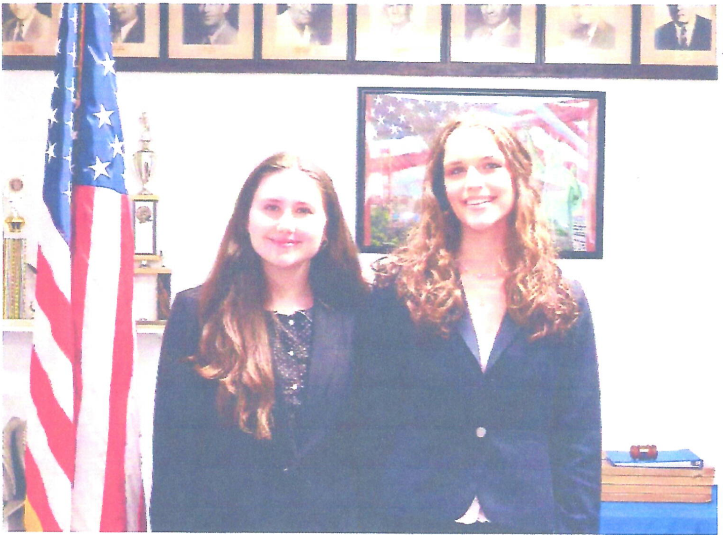
American Legion Auxiliary, Winter Park Memorial Unit 112 2026 Girls State Delegates